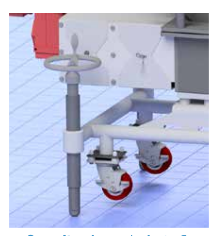
Security - lower jacks to floor so equipment is stable and sitting on feet.

Adjust each jack to quickly level equipment or tilt for better drainage.